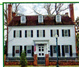
Attmore-Oliver House 511 Broad Street, ca. 1790-1800 owner: New Bern Historical Society